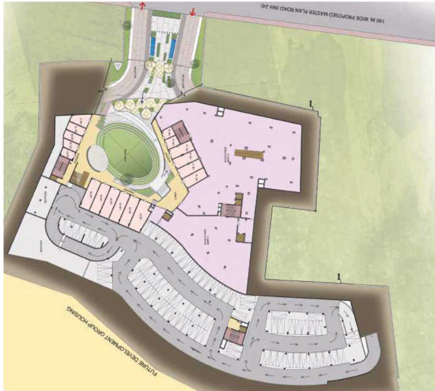
LOWER GROUND FLOOR PLAN

Note: Saleable area is tentative and is subject to change due to modifications asked for by approving authorities from time to time till completion certificate is obtained. Architect reserves the right to add/delete any detail/specification/elevation mentioned if so warranted by circumstances.