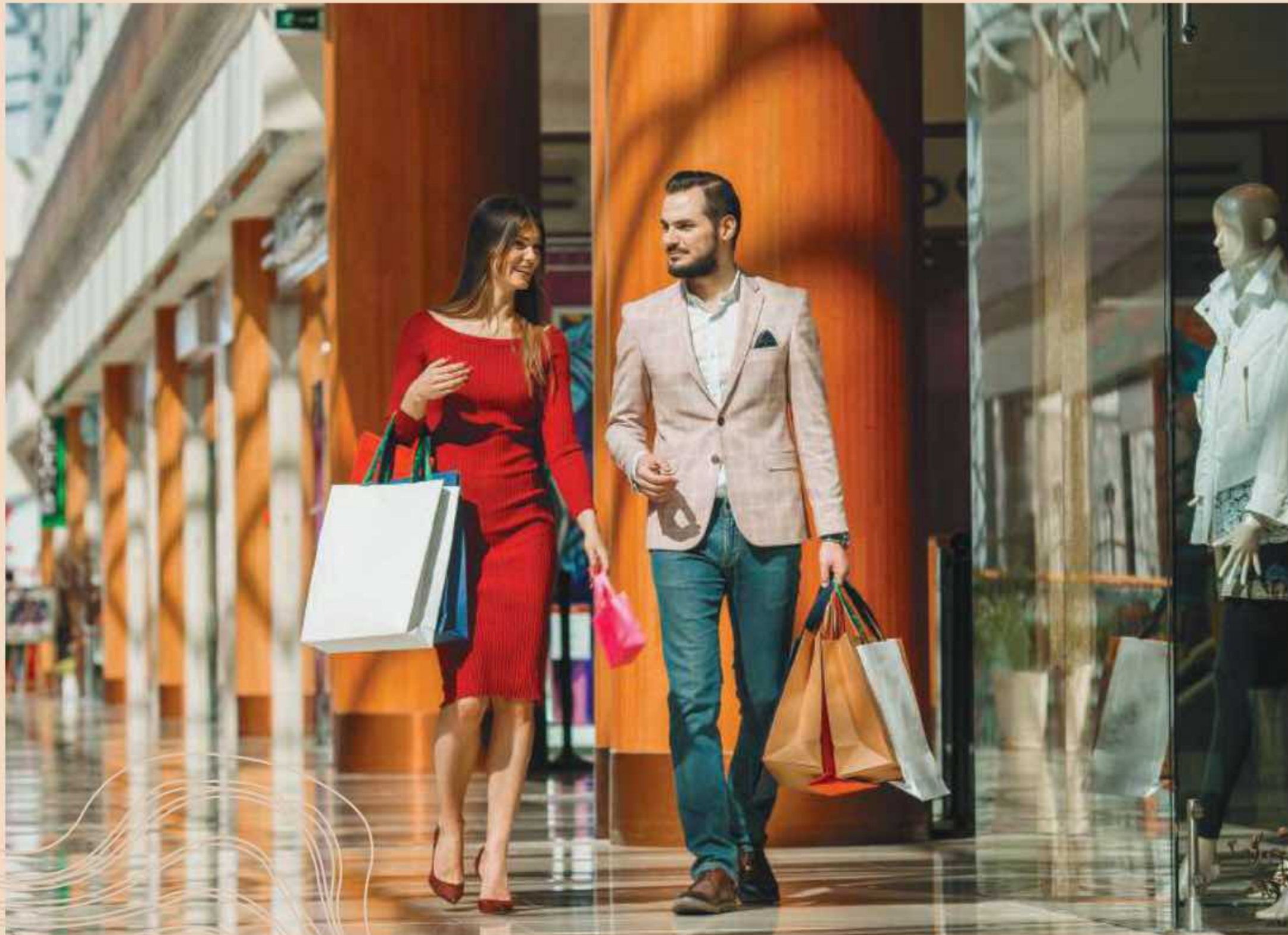
The image shown is for demonstrative purpose only and is subject to change.